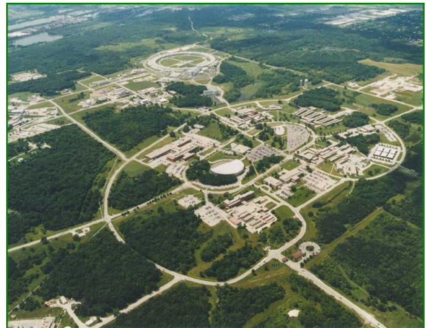
Argonne National Laboratory

“Vulnerability Assessment’s Big Picture”, CSO Magazine , http://www.csoonline.com/read/060107/fea_qa.html