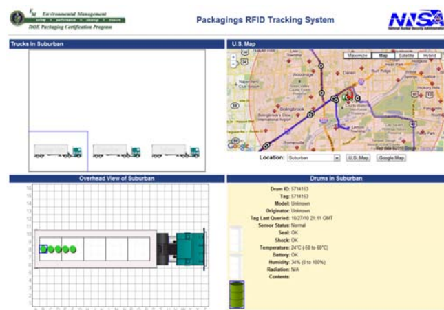
Figure 3. Screen capture of the ARG-US TransPort Web interface